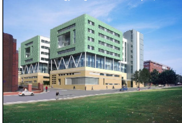
The New Oncology Wing at St James's Hospital, Leeds